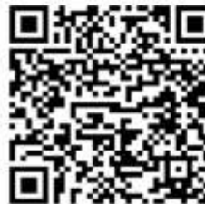
Link to this flyer

Junior members have full club privlidges to all venues. May participate in junior archery, pistol, rifle and shotgun.